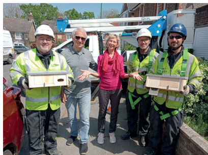
UK Power Networks volunteers installing swift boxes in Trafalgar