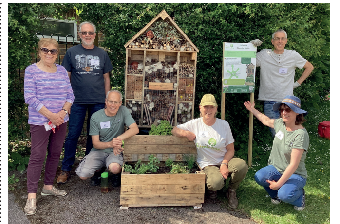
Installation of the Pollination Station at Trafalgar Infant School

The next HDOPF meeting is at Brighton Rd Baptist Church on Friday 6th December 2024, 10-12, to meet new MP John Milne.